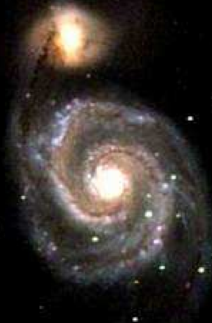
M51, Whirlpool Galaxy